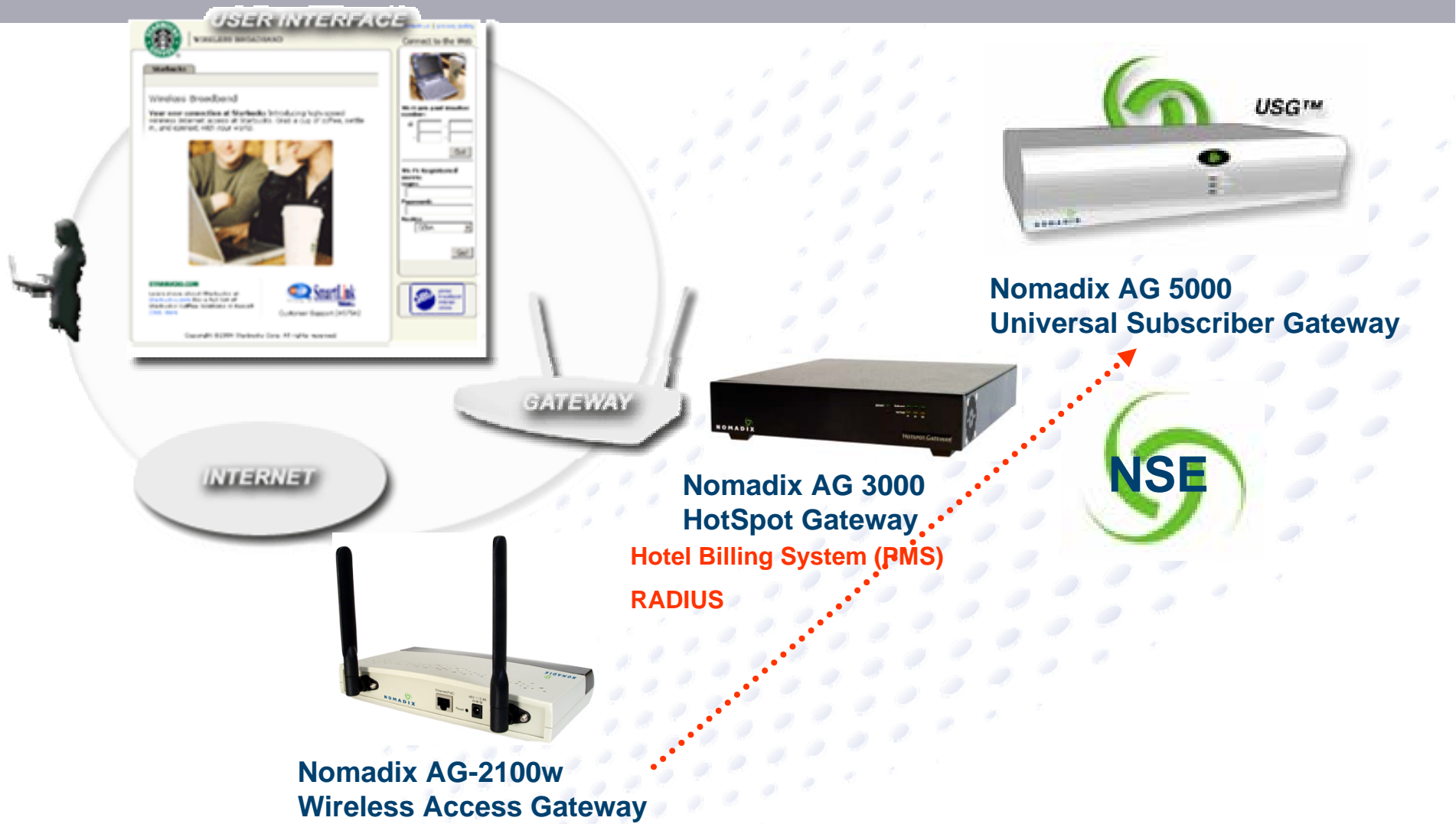
Nomadix AG-2100w Wireless Access Gateway